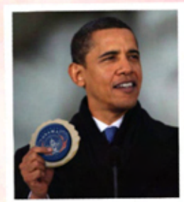
White House Favorite Cookies