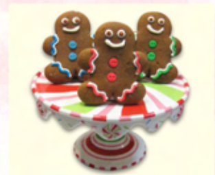
Best Gingerbread Cookie Award