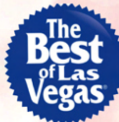
Best of Las Vegas - Bakery & Birthday Party Place